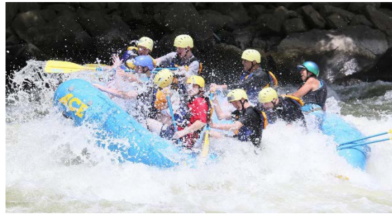
Troop 282 getting soaked by a large rapid See the video at the Troop website <a href="https://www.t282.org">www.t282.org</a>

The Troop got up early the next morning and made breakfast before heading out. They grabbed their paddles and life jackets before taking the mile ride to the river. Once they arrived, they got a raft and guide and started on class 1 and 2 rapids. However, they spent most of the day on class 3 and 4's, and even a few class 5's.